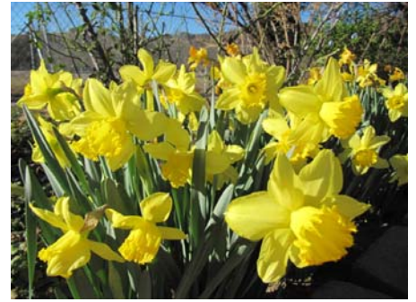
Flower