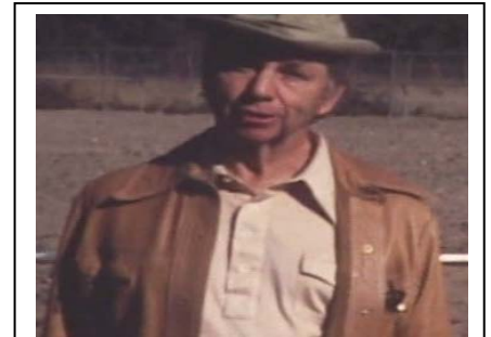
Alvy Moore (Hank Kimble of Green Acres)