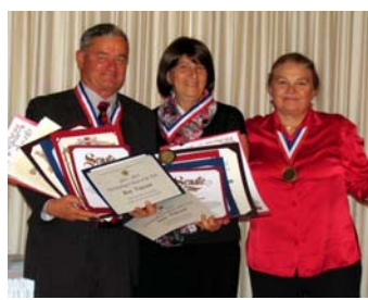
Chatsworth Community Coordinating Council Banquet

Chatsworth Historical Society Board of Directors 2015-2016