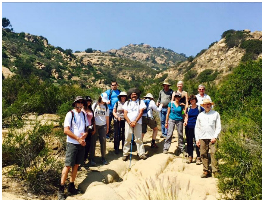
April 19, 2015 hikers on Stagecoach Trail

The rocks sure looked familiar, so we challenged our local Santa Susana Pass State Historic Park (SSPSHP) volunteers to hike the trail and find the exact location of this photo based on the background features.